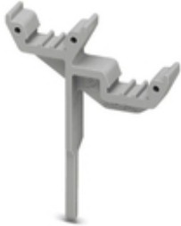
Marker carriers, gray, unlabeled, mounting type: plug in, lettering field size: 4 x 10.5 mm

Please be informed that the data shown in this PDF Document is generated from our Online Catalog. Please find the complete data in the user's documentation. Our General Terms of Use for Downloads are valid ( http://phoenixcontact.com/download )